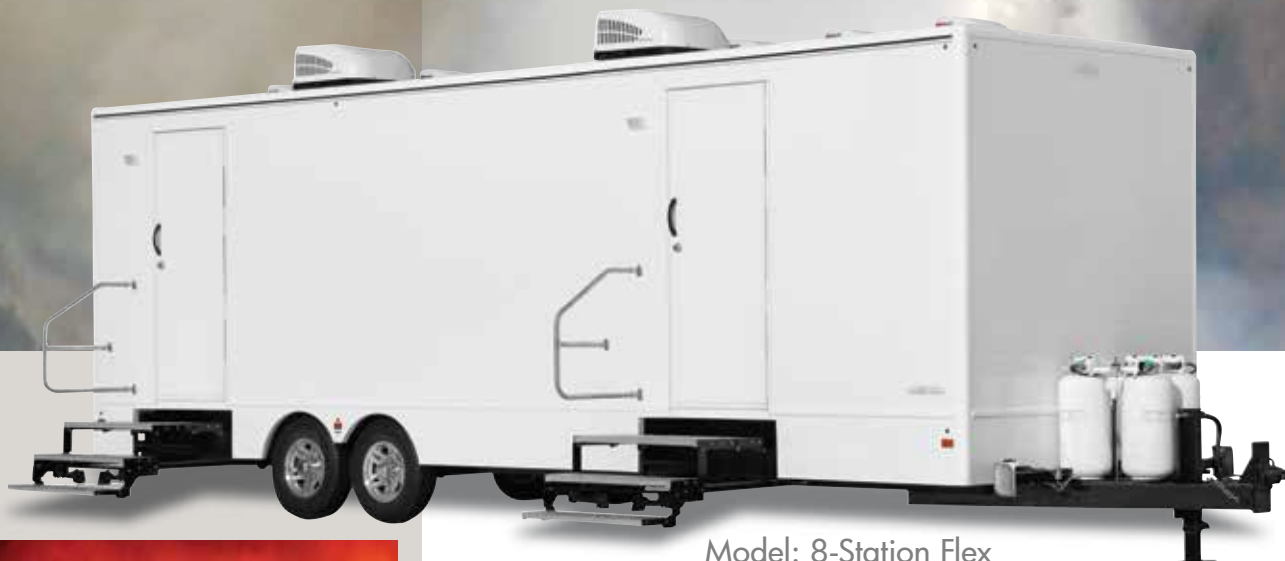
Model: 8-Station Flex